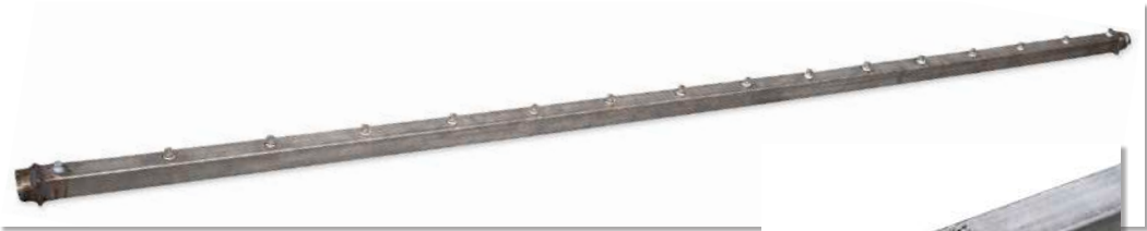
8-foot stainless-steel spray bar with 1/2-inch square tubing