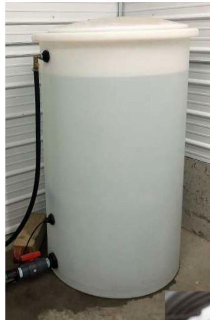
250-gallon holding tank, with brass float valve and supply plumbing