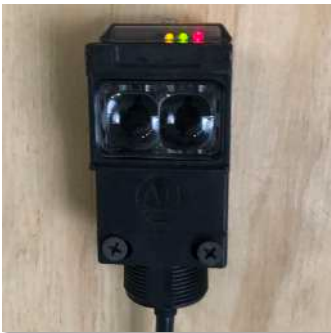
Photo-eye with 10-foot maximum range