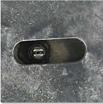
Sixteen 25°, size 15 nozzles spaced 6-inches apart, for low undercarriages