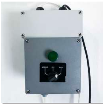
Remote box for auto/manual operation of spray bar