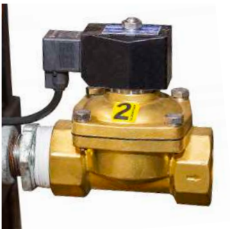
Auto flow control solenoid that opens water flow valve when system is on and closes when off to prevent drainage