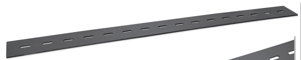
100-inch x 1/2-inch powder coated spray bar cover with nozzle holes