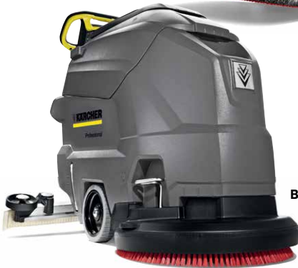
BD 50/50 C CLASSIC BP