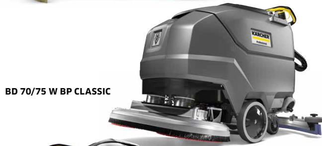
BD 70/75 W BP CLASSIC