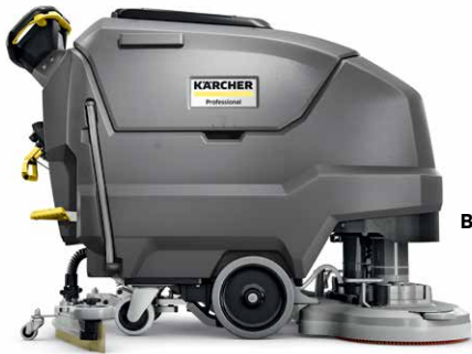
BD 80/100 W BP CLASSIC

Designed to meet all of your scrubbing needs without breaking the bank. With the BD 70/75 W Classic Bp, BD 80/100 W Classic Bp and BD 50/50 C Classic Bp scrubbers, Kärcher presents its Classic Scrubber Line. Battery-operated machines with a very solid construction and are characterized by simple operations. They offer an economical start in floor cleaning and are suitable for use in industrial facilities, retail stores, municipalities, education and for cleaning buildings. No matter the area size you're cleaning, there's a classic solution to fit.