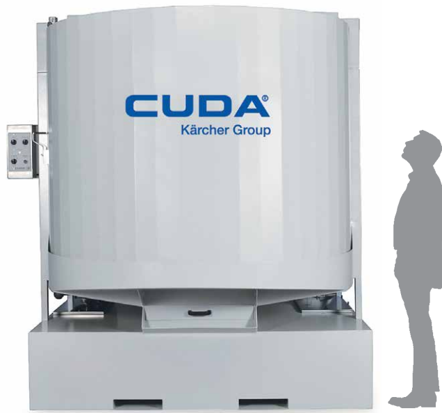
Approx. scale to 7272 model