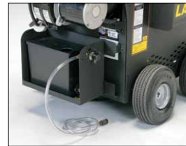
Optional rust-free Float Tank with stainless steel inlet filter, backflow protection and inlet detergent metering valve (8.917-506.0).